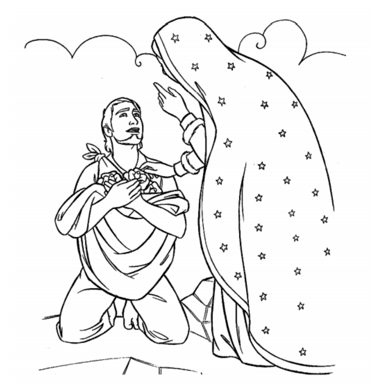
Our Blessed Mother carefully arranged the flowers in his tilma, then closed it around them. "Do not unfold your tilma and show these flowers to anyone but the bishop," she said.