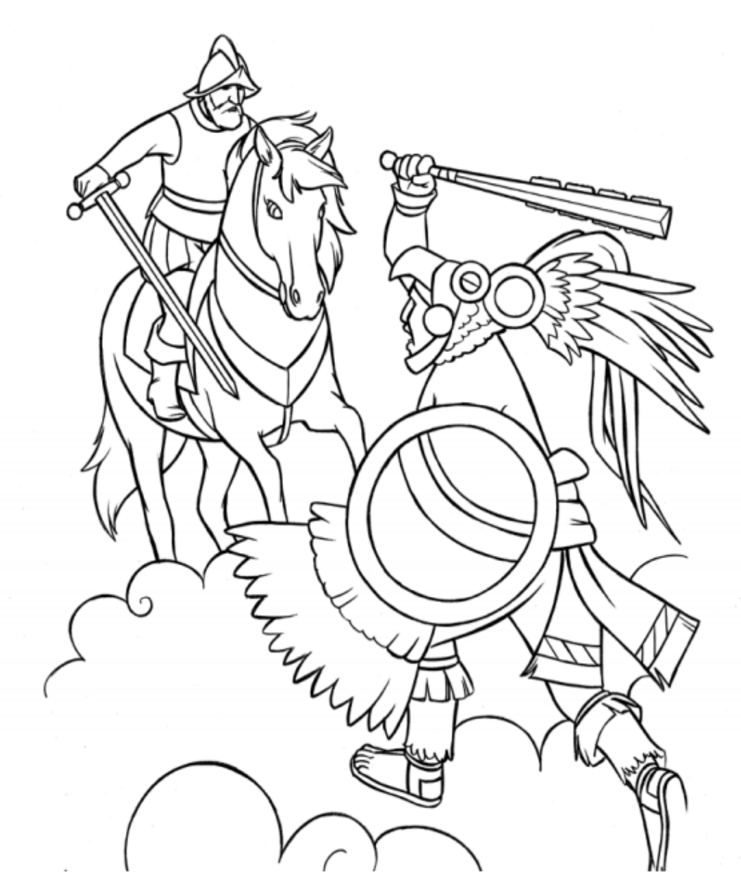
In 1519, Spanish soldiers came to Mexico. They defeated the Aztecs. The Spanish brought Catholic priests to teach everybody in Mexico about the True God and that Jesus Christ came to save everyone.