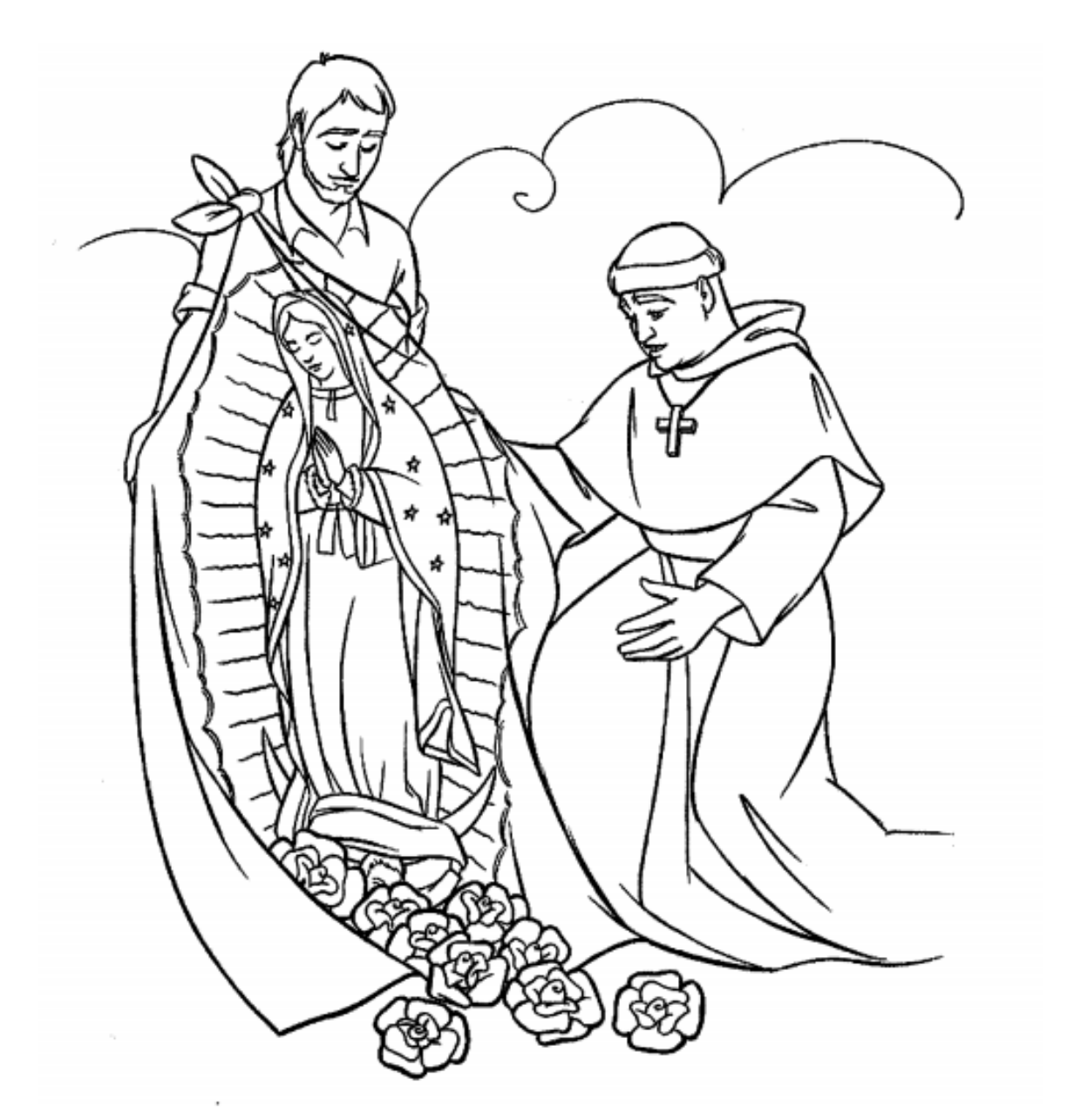
Juan Diego hurried to the bishop's house. Juan Diego opened his tilma to show the bishop the miraculous roses. Then an even greater miracle appeared: an image of the beautiful lady surrounded by the sun!