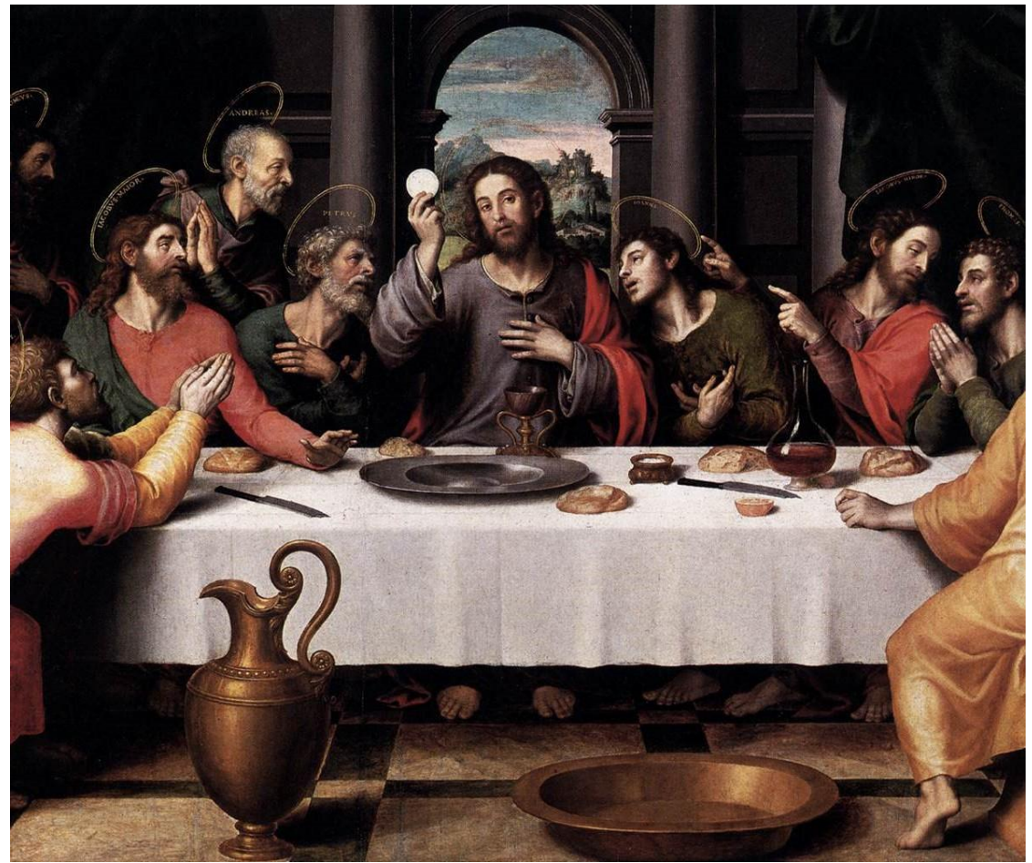
The Last Supper, Juan de Juanes

Child/family Session #1: Encountering Jesus in the Eucharist