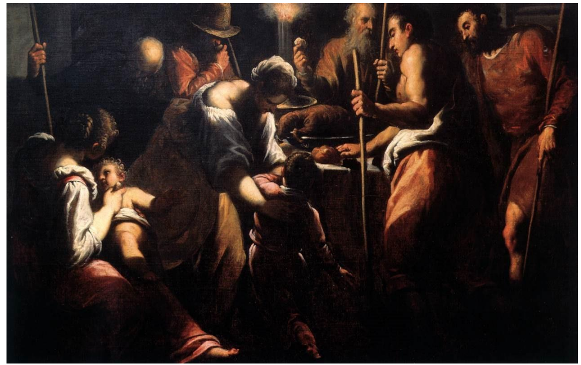
Passover, Palma Giovane

Child/family Session #5: The Scriptural Basis of the Eucharist