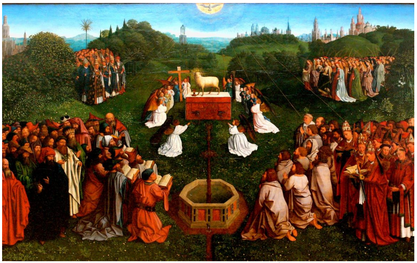
Adoration of the Mystic Lamb, Jan van Eyck

Child/Family Session #6: The Mass: Sacrifice, Thanksgiving, Memorial, Presence