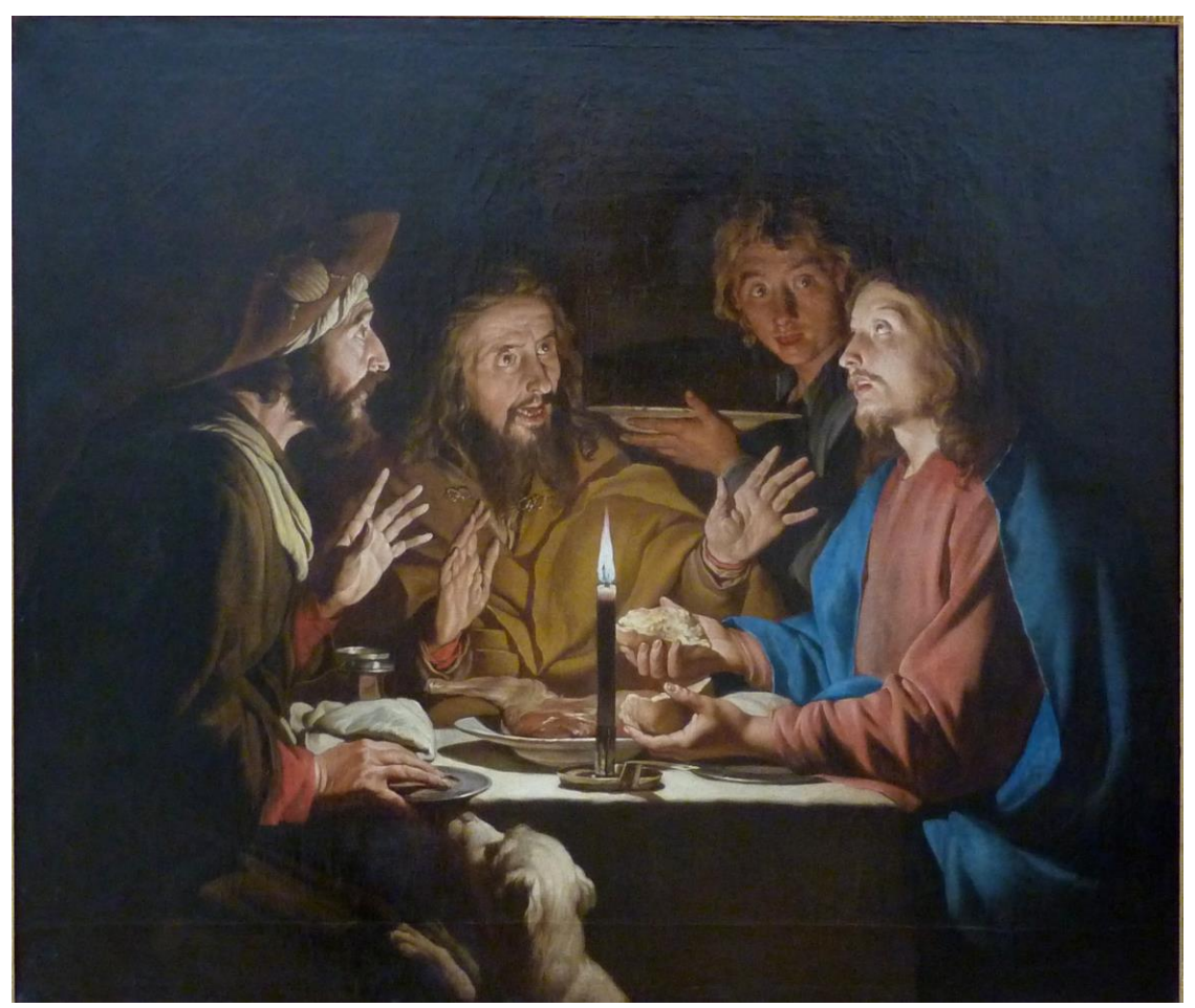
Supper at Emmaus with Candlelight, Matthias Stom

Child/family Session #4: The Eucharist – Presence, Communion, Sacrifice--Source & Summit!