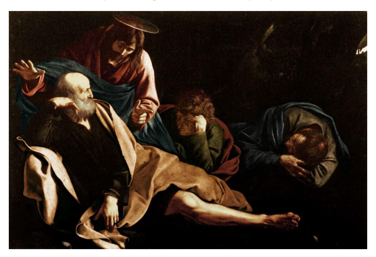
Christ in the Garden, Michelangelo Merisi da Caravaggio

Children/Family Session #2: Praying with Jesus in the Eucharist: ARRR (Acknowledge, Relate Receive, Respond)