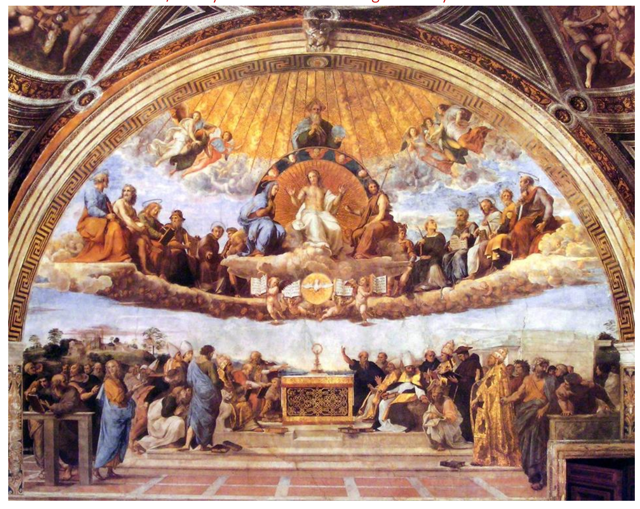
Disputation of the Holy Sacrament, Rafaello Sanzio

Child/Family Session #7: The Pledge of Glory to Come