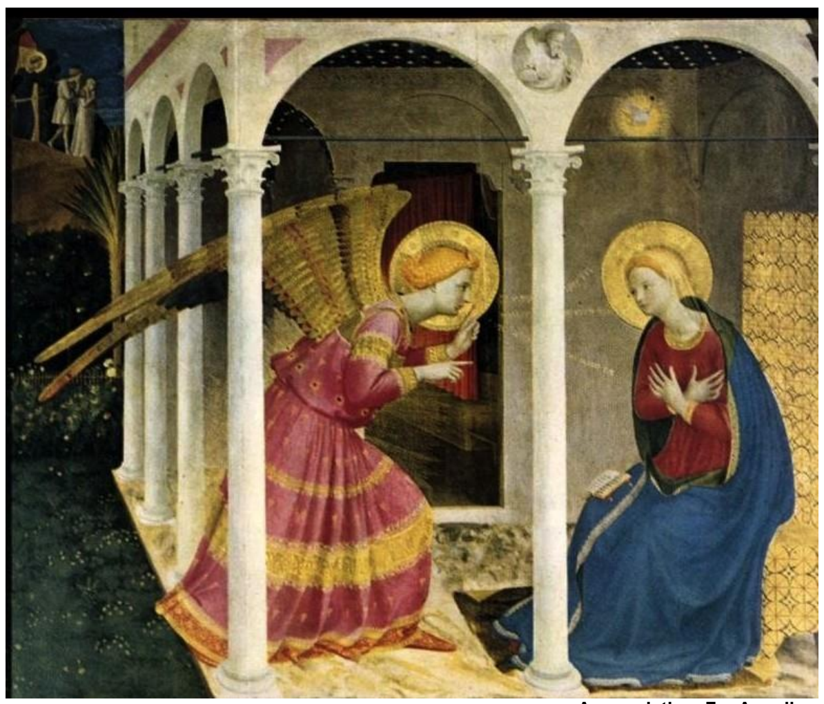
Annunciation, Fra Angelico

Child/Family Session #8: Annunciation: Mary, Mother of the Eucharist