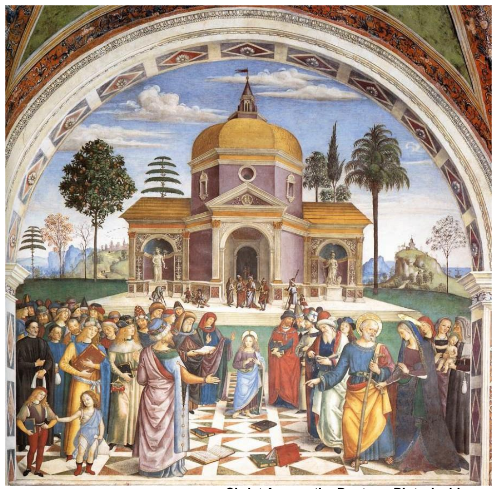
Christ Among the Doctors, Pinturicchio

Child/Family Session #3: Praying with Jesus in the Eucharist: Lectio Divina