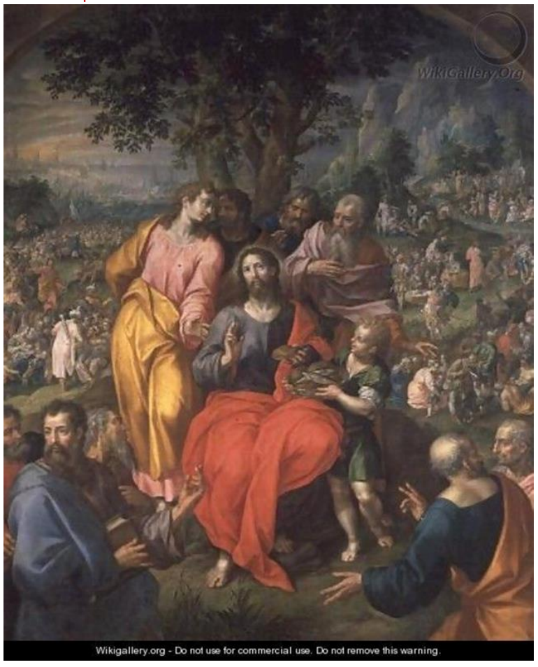
The Feeding of the Five Thousand, Hendrick de Clerck

Child/family Session #5: The Scriptural Basis of the Eucharist