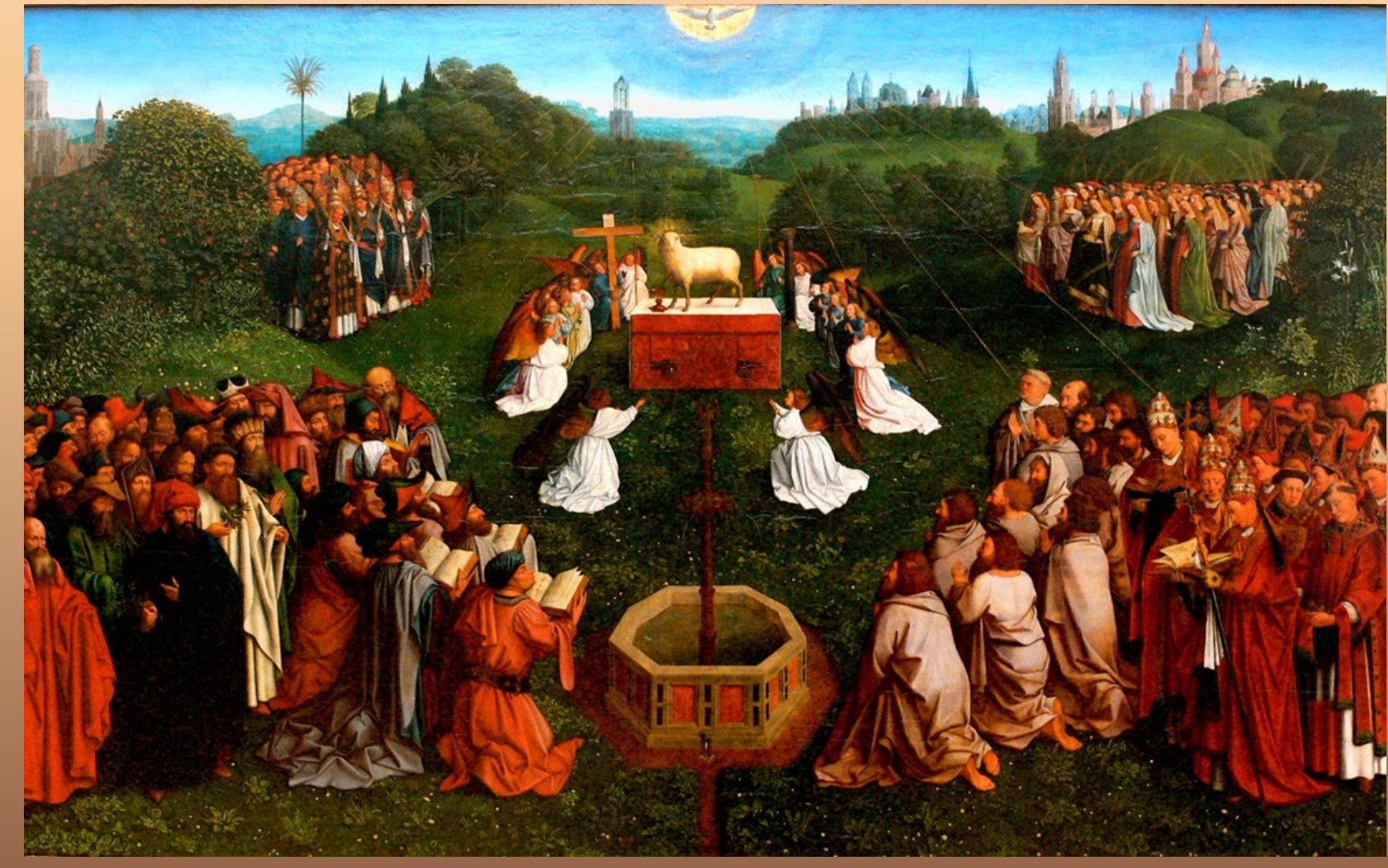
Adoration of the Mystic Lamb, Jan van Eyck

Child/Family Session #6: The Mass: Sacrifice, Thanksgiving, Memorial, Presence