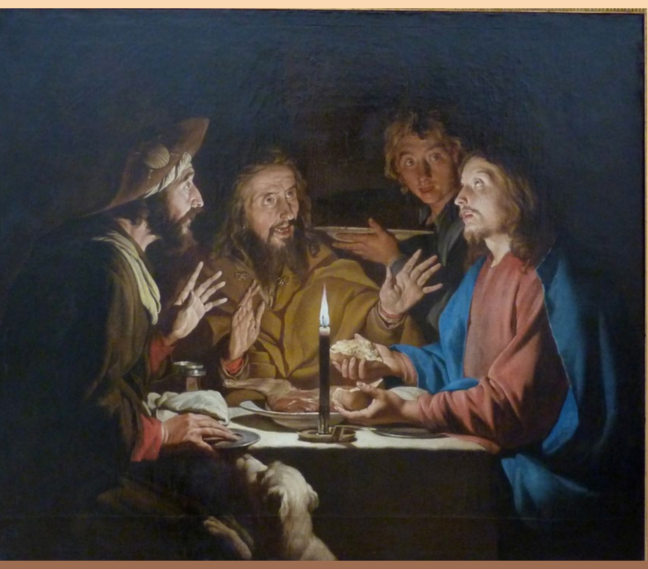
Supper at Emmaus with Candlelight, Matthias Stom

Child/family Session #4: The Eucharist – Presence, Communion, Sacrifice--Source & Summit!