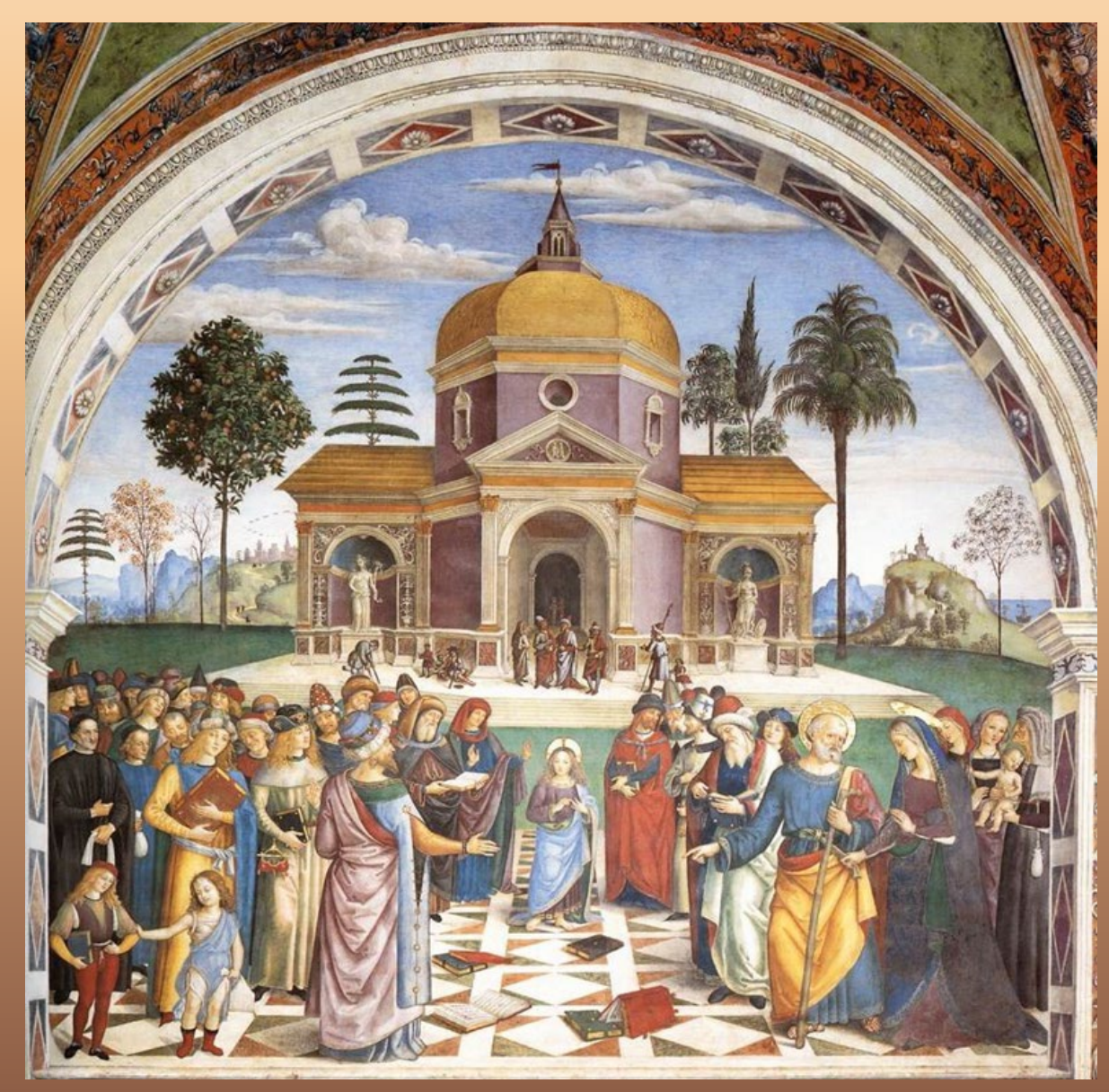
Christ Among the Doctors, Pinturicchio

Child/Family Session #3: Praying with Jesus in the Eucharist: Lectio Divina