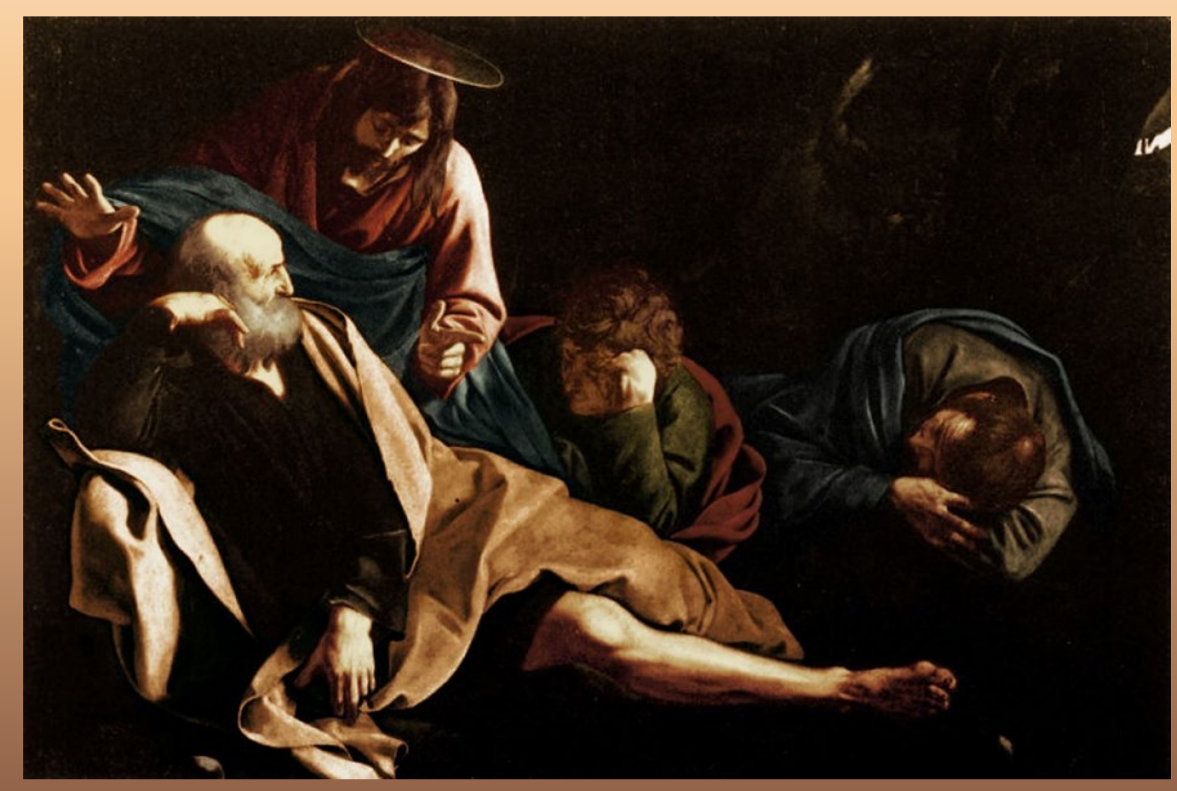
Christ in the Garden, Michelangelo Merisi da Caravaggio

Children/Family Session #2: Praying with Jesus in the Eucharist: ARRR (Acknowledge, Relate Receive, Respond)